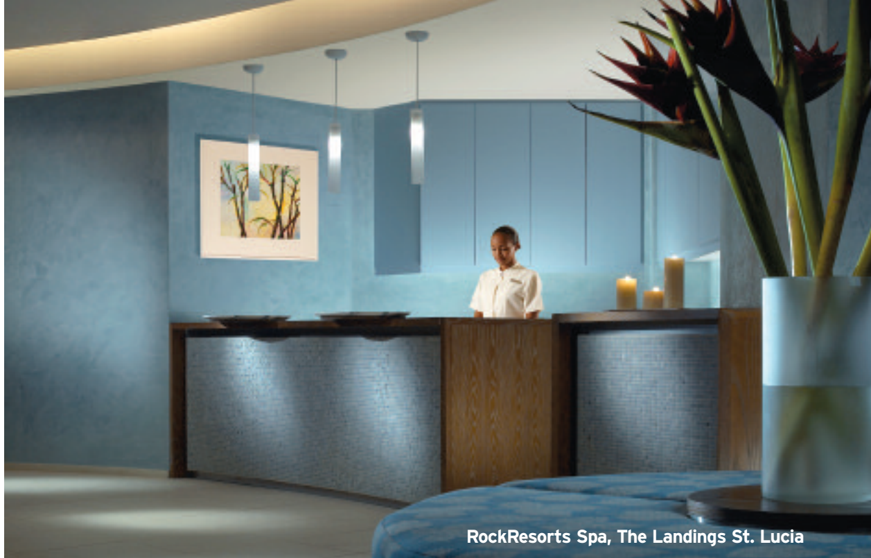
RockResorts Spa, The Landings St. Lucia