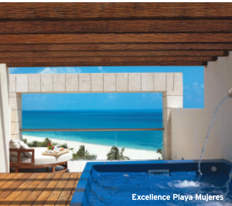
Excellence Playa Mujeres

→ YOU... ONLY BETTER CONTINUED FROM PAGE 79