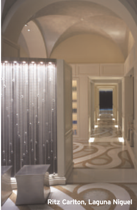
Ritz Carlton, Laguna Niguel