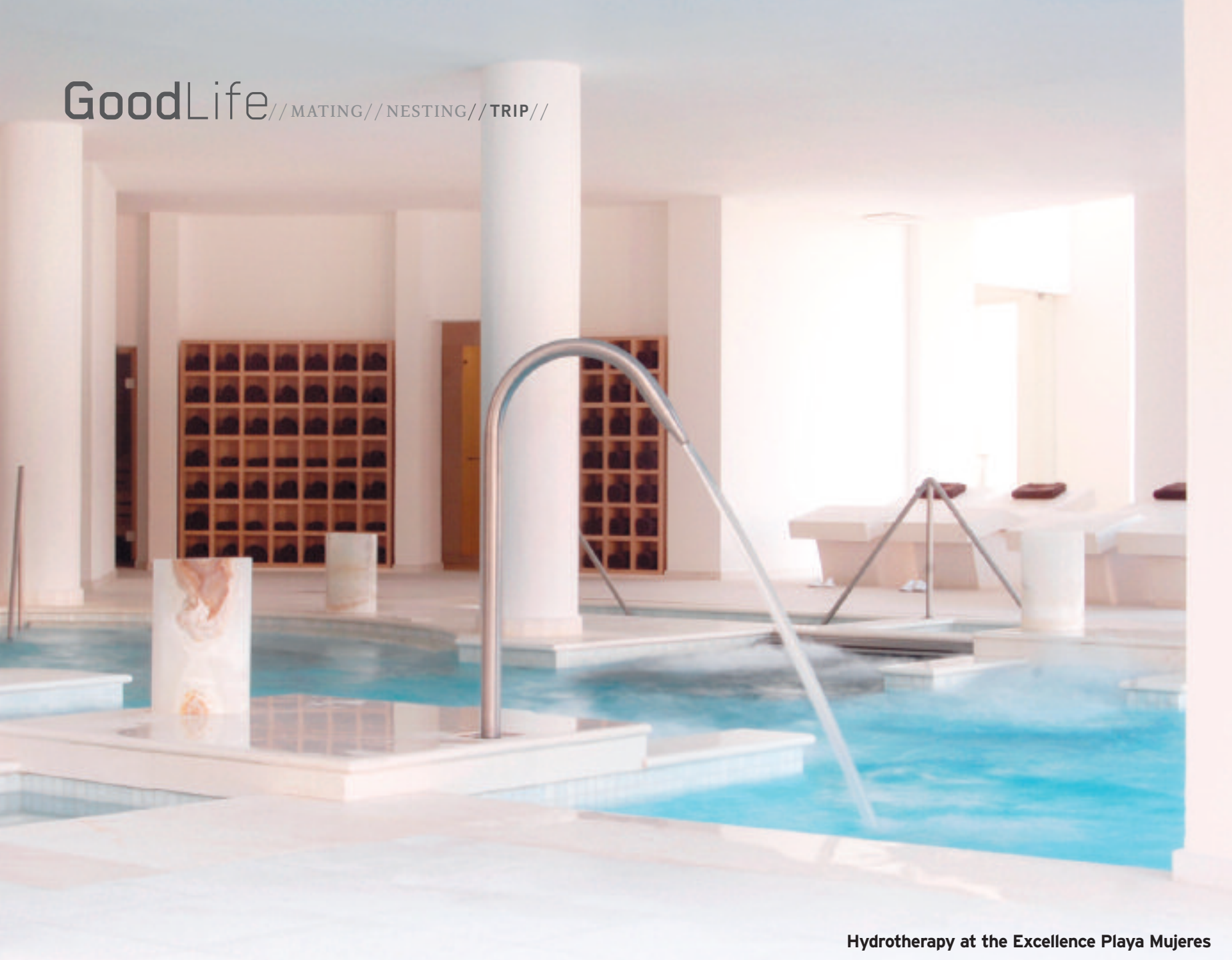
Hydrotherapy at the Excellence Playa Mujeres