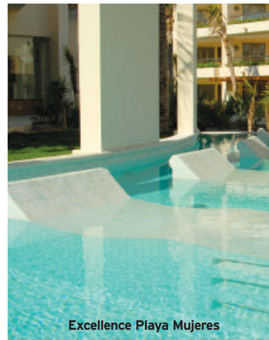
Excellence Playa Mujeres

with development expected to continue through 2010 (think 19 acres eventually laying claim to 231 waterfront residences). In the here and now, colorful Caribbean flowers help to camouflage the construction for which the resort has made generous compensations in terms of introductory pricing with 50% discounts in the spa.