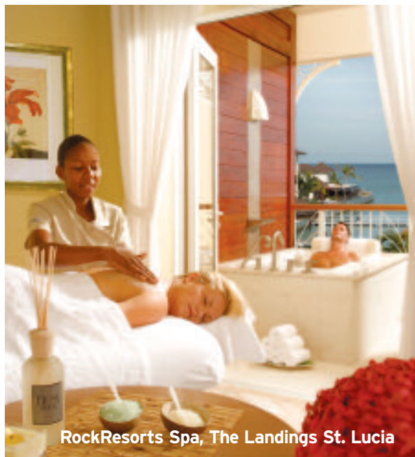
RockResorts Spa, The Landings St. Lucia